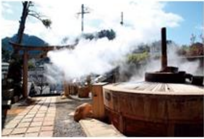
Hot spring source spurting out waters close to 100°C in temperature