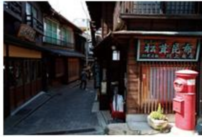
Streetscapes beloved from days of old, exuding ambiances truly unique to Arima