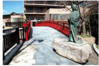
Nene Bridge – with red parapets truly enchanting to the eye